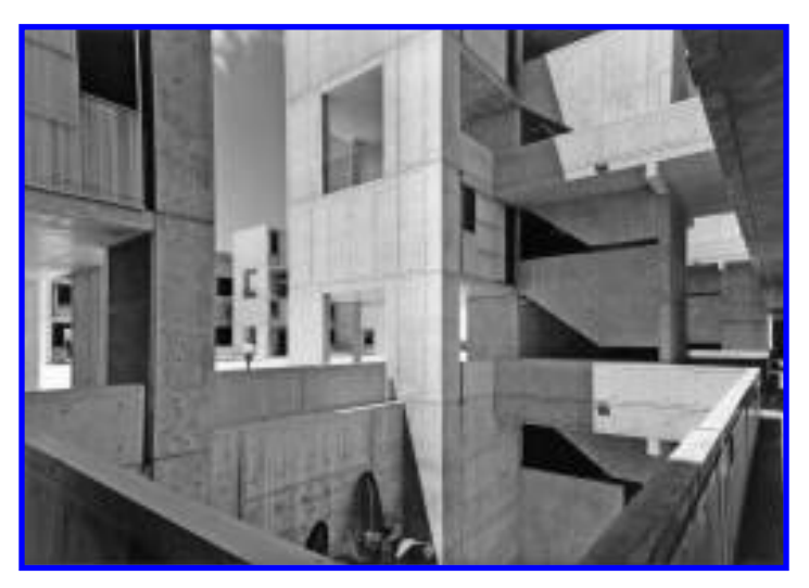
FIG. 8 Ezra Stoller's photograph perfectly captures the complexity of Kahn's design. Note how light and shadow play across the beautifully finished concrete, with its symmetrical plugs. The teak shutters of the studies contrast with the smooth concrete beside them. The light well in the center opens the basement laboratory to the sun.

exalted the Institute as an American masterpiece. The building so moved the music critic Leonard Burkat that he told the Institute's president that it "should be photographed by one of the great photographers of nature . . . The site is Acropolitan and the buildings a kind of Parthenon, a temple of wisdom with a secret geometry and a poetic life of its own."<sup>154</sup> He thought Ansel Adams might do it justice. Ezra Stoller so admired Kahn's work that he photographed it on his own time. He appreciated the complexity of Kahn's design, which powerfully captured the play of light and form.<sup>155</sup> (Fig. 8)