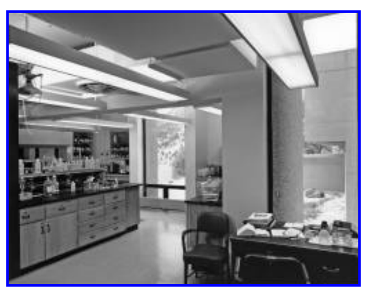
FIG. 4 Chemistry laboratory at NCAR. Designed as wet labs for small teams of conventional atmospheric chemists, these laboratories would become increasingly obsolete in an era of satellite imaging and computer modeling.