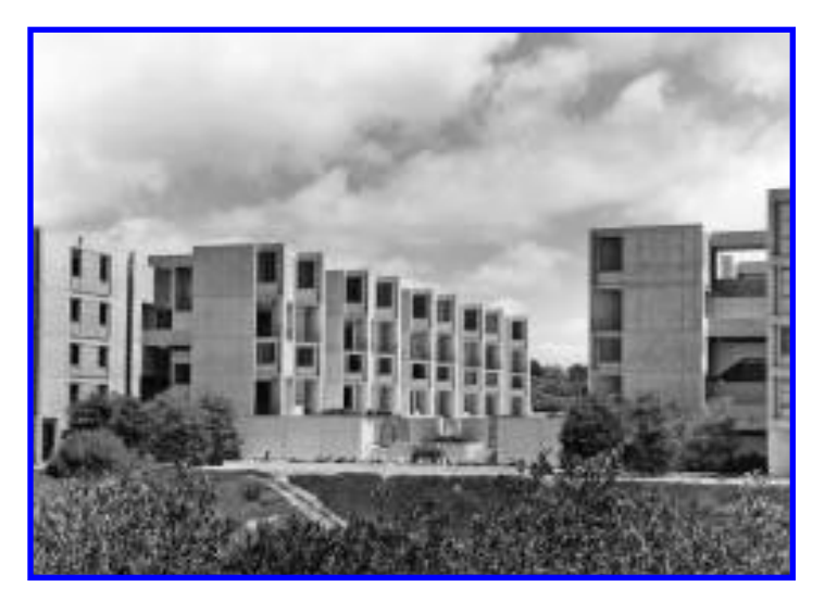
FIG. 5 The Salk Institute from the west. The studies, arranged so that each has an unobstructed view of the Pacific, flank the courtyard, connected to the laboratories by staircases visible on the far right. The watercourse empties into the pool just below the center of the courtyard.

government agency.<sup>83</sup> As a physician, Salk expected significant medical breakthroughs from his Institute, but he thought direct oversight would be counterproductive.