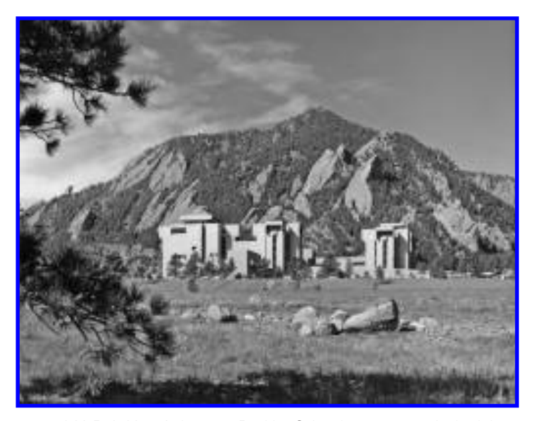
FIG. 1 I. M. Pei's Mesa Laboratory, Boulder, Colorado, set against the backdrop of the Flatiron Range. Note the deceptive scale, the hooded towers, and flat roofs.

a fresh perspective.<sup>11</sup> Roberts and Salk agreed, however, that when a laboratory exceeded a few hundred researchers and staff, it faced the law of diminishing returns. They hoped to avoid the increasingly impersonal and bureaucratic science exemplified for Roberts by the National Bureau of Standards (NBS), which had built a branch laboratory in Boulder in the early 1950s, and for Salk by the National Institutes of Health (NIH) and major medical school research campuses.