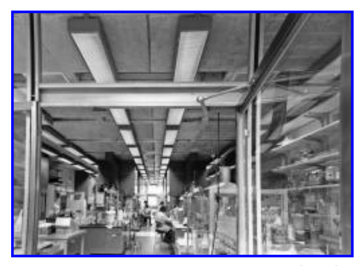
FIG. 7 Kahn's structural innovations opened up the laboratories to football field dimensions. The interstitial space above allowed quick change out and an endless variety of laboratory designs. For the most part, the scientists arranged their labs conventionally, with services at the center and benches around the perimeter.

lab benches that could quickly be attached to utility lines through service portals in the ceiling. (Fig. 7)