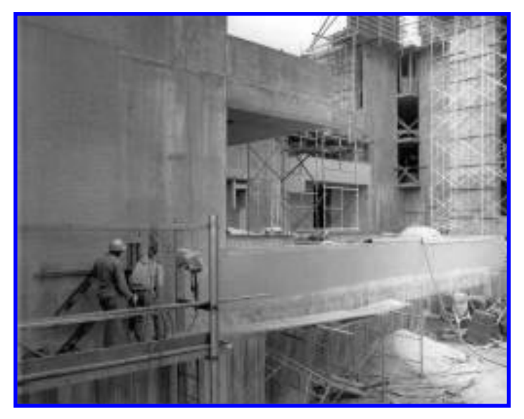
FIG. 3 NCAR's Mesa Laboratory under construction. Workers at the lower left are bush hammering the concrete for a uniform texture. Compare finished concrete with rough form finish to the right.

corner windows in their laboratories would create glare and heat "and will become covered with aluminum foil as a result."<sup>62</sup> A full-scale mock-up convinced them that their offices would have sufficiently generous views, and air conditioning and tinted glass at least reduced excessive heat and glare. What Pei considered one of the building's architectural signatures, its distinctive flat roofs, the scientists took for granted as just another workspace. Wolff warned Pei, "the appetite of atmospheric scientists for roof space is insatiable."<sup>63</sup> Once the building had been completed, the rooftops would sprout antennas, probes, sensors, domes, and compressors, which in Pei's eyes marred the building's deliberately stark profile. He adamantly opposed the two penthouses that scientists insisted be placed on the main tower roofs for immediate access to observational equipment, though he ultimately allowed one on the north tower.