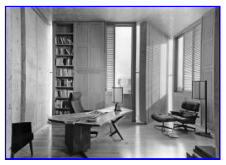
FIG. 6 The "architecture of the oak table and the rug" exemplified in one of the Salk studies, with oak paneling and teak shutters. The modernist furniture completes Kahn and Salk's vision of the scientist as humanistic philosopher. The open book near the chair and ottoman, obviously staged, suggests the contemplative mood Kahn had in mind, though the room is appropriately empty, since few active researchers saw any reason to retreat to their studies.

for independent discovery, the Meeting House for collective reflection. These spaces drew attention to their shared belief in "the importance of the Question and not the preoccupation constantly with answers."<sup>127</sup>